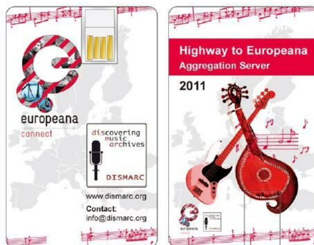
Figure 1: The Highway to Europeana USB-card (version 2011)

This concept is referred to as the 'Highway to Europeana'.